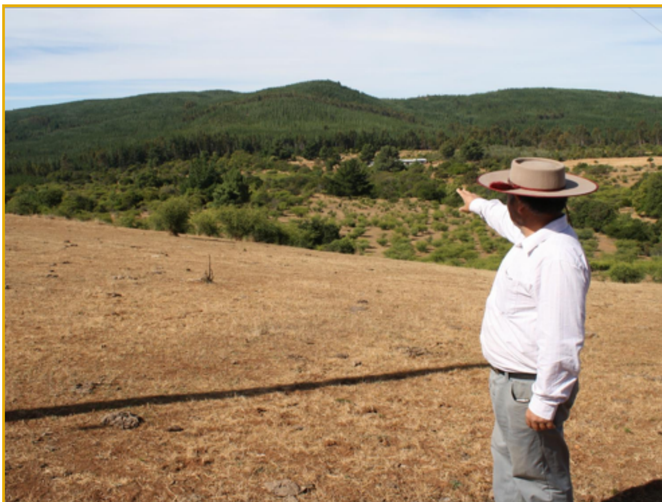
Land use changes in Chile.